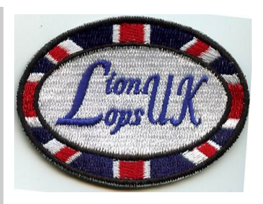
Don't forget your Official Coat Badge -Available from the Secretary @ £4 each