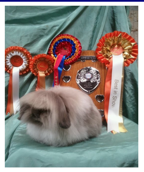
Upton's DeLucia, Iron Grey Doe B.I.S. Spring SS at Wallsend